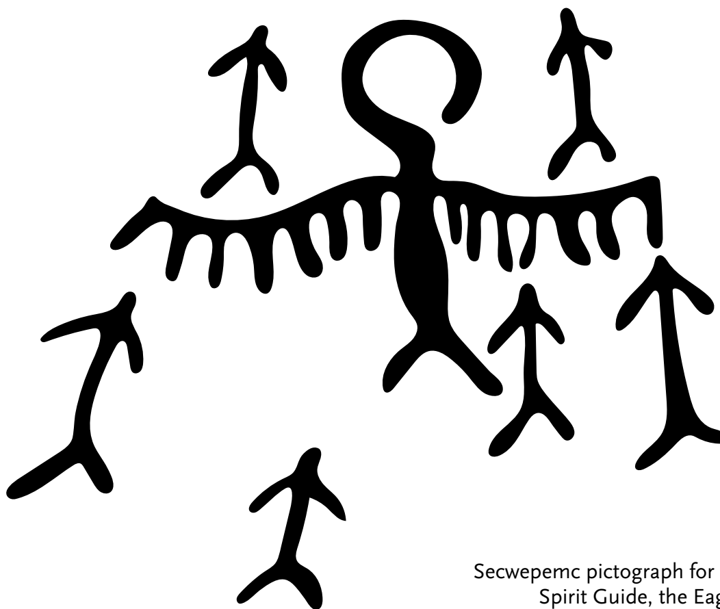
Secwepemc pictograph for the Family Spirit Guide, the Eagle.

Article 31.2. In conjunction with Indigenous peoples, States shall take effective measures to recognize and protect the exercise of these rights.