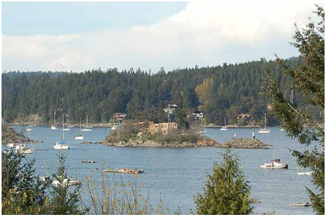
Grace Islet, B.C., 2014, includes a registered archaeological site and burial ground on which the property owner was allowed to begin construction of a home until stopped by protests by local First Nations and their allies.