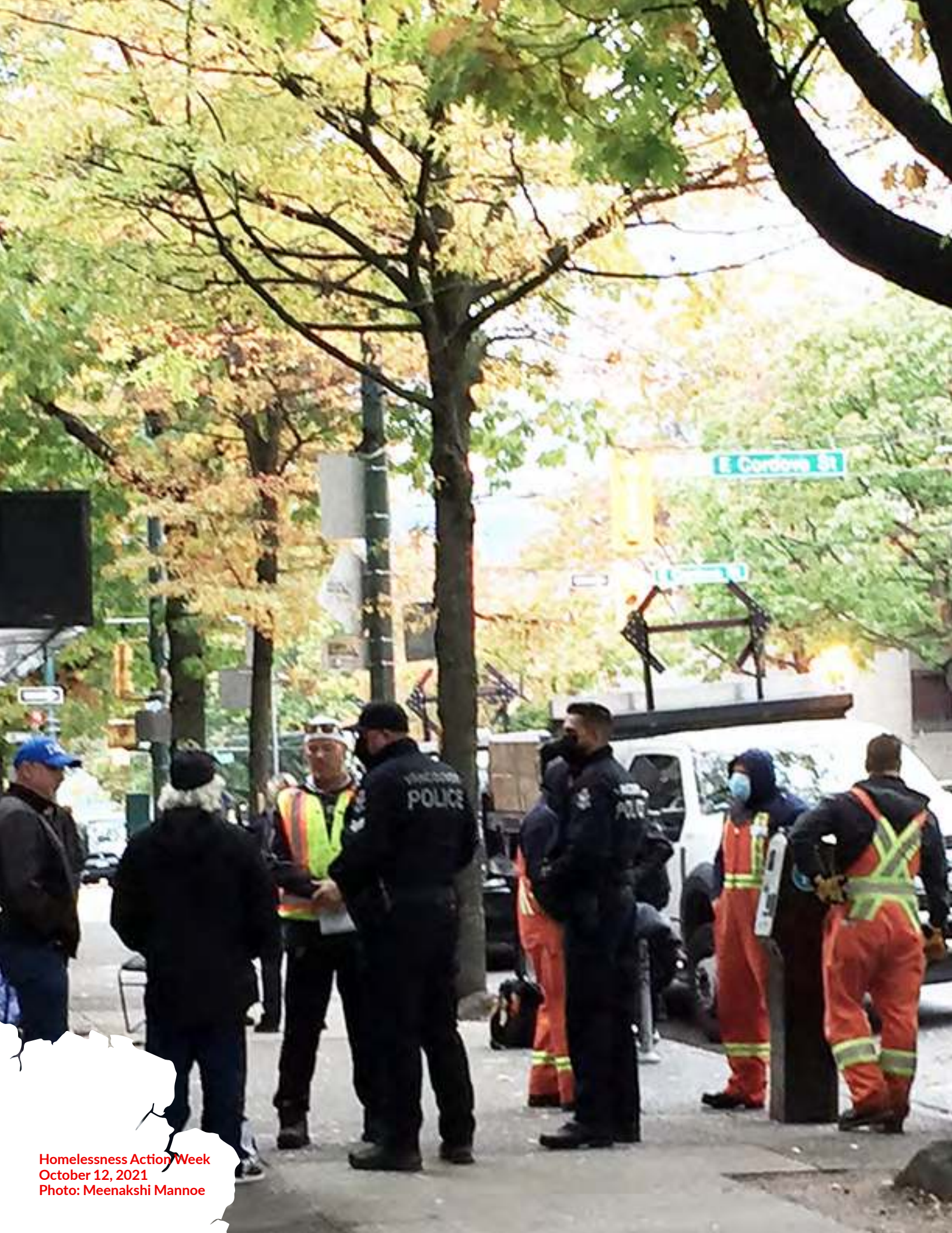
Homelessness Action Week October 12, 2021