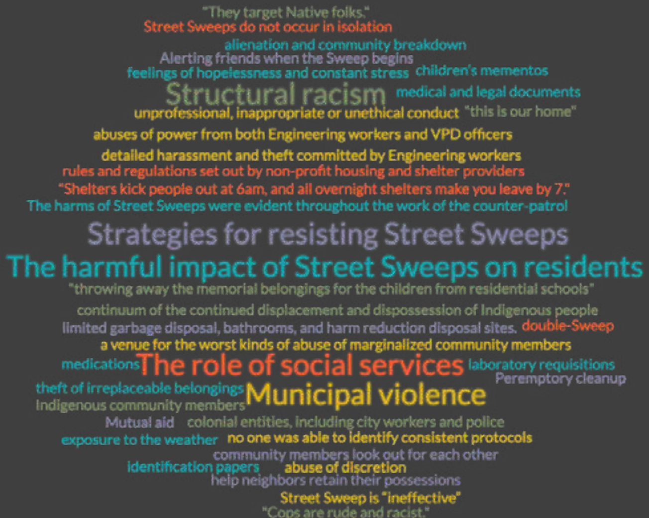
Figure: Emergent overlapping themes and keywords from 1:1 interviews.