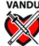
Vancouver Area Network of Drug Users (VANDU)