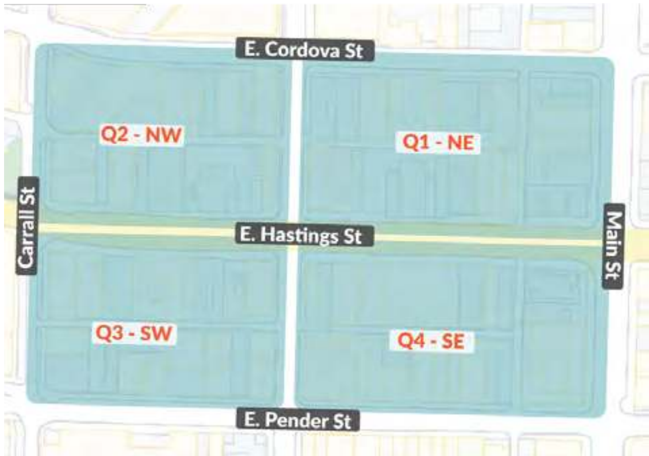
Figure: The observed blocks surrounding the intersection of East Hastings and Columbia Streets. This intersection includes the 100 block of East Hastings Street, which is the most frequently targeted stretch of street for daily Street Sweeps.

The counter-patrol team focused its outreach, observation, and research activities on four quadrants, illustrated above. These quadrants were chosen by peer members of the #StopTheStreets Coalition as areas which are highly targeted for daily Street Sweeps, especially the 100 block of East Hastings. The quadrants would be the focus of the counter-patrols each day, beginning with the Northeast quadrant (Q1) on October 10th and moving counterclockwise until the Southeast quadrant (Q4) was reached on October 13th. The counter-patrol returned to the Northeast quadrant (Q1) on the fifth day of patrols.